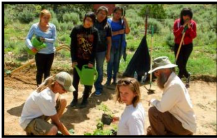
Summer Associates and community youth planting a community garden in Cuba, NM

Summer Associate VISTAs are placed for 6-8 week service terms in sites that are also hosting full-year BRIDGE Network VISTAs (Community Stewards) that apply. In 2015 BRIDGE Network successfully applied for and received 26 AmeriCorps*VISTA Summer Associates for the summer of 2015. Summer associates served in 12 states in support of DOI, TCU, and OSMRE VISTAs. Summer Associates focus on short-term direct service projects that resulted in: