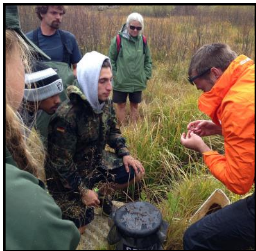
DOI/VISTA sites Northeast Trees, Sequoia and Kings Canyon, and Outward Bound Adventures partnered to allow youth who live in the neighborhoods surrounding the LA River to travel to Sequoia and Kings Canyon National Park for an Experiential Learning Trip.

In FY 2015, 79 DOI/VISTAs served with nonprofits and public land management agencies in order to support underserved communities in using public lands for employment opportunities, health, and education. The service of DOI/VISTAs this year resulted in: