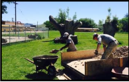
NCCC Members shoveling stone at Mountain Valley School in Saguache, Colorado

The National Civilian Community Corps (NCCC) traveled to several BRIDGE Network Sites this quarter to provide direct service projects like construction, trail maintenance, cleanups, and landscaping. In 2014, 43 NCCC members served 8,256 hours with 8 sites resulting in: